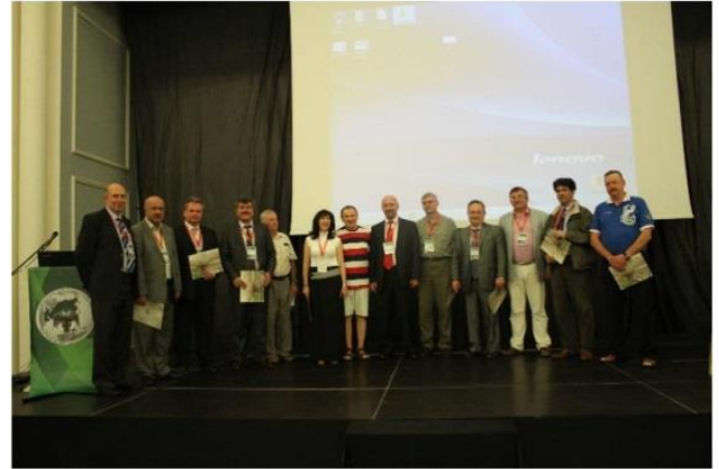
A photo of all participants together after the closing ceremony of the congress.